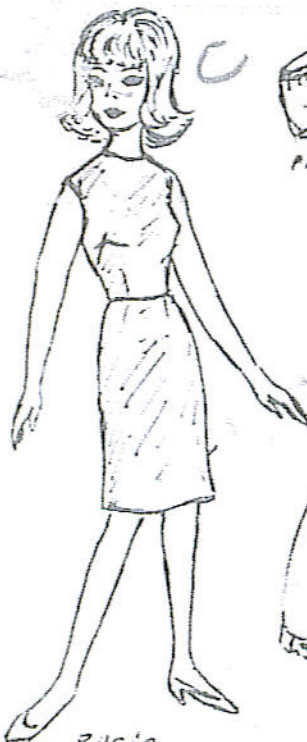
BASIC SHEATH DRESS